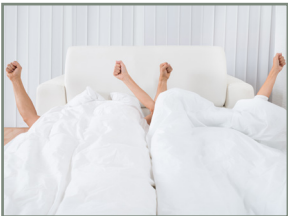
Wake-up Alarm Clock