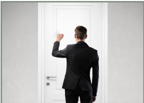
Door Knock or Door Bell Notification